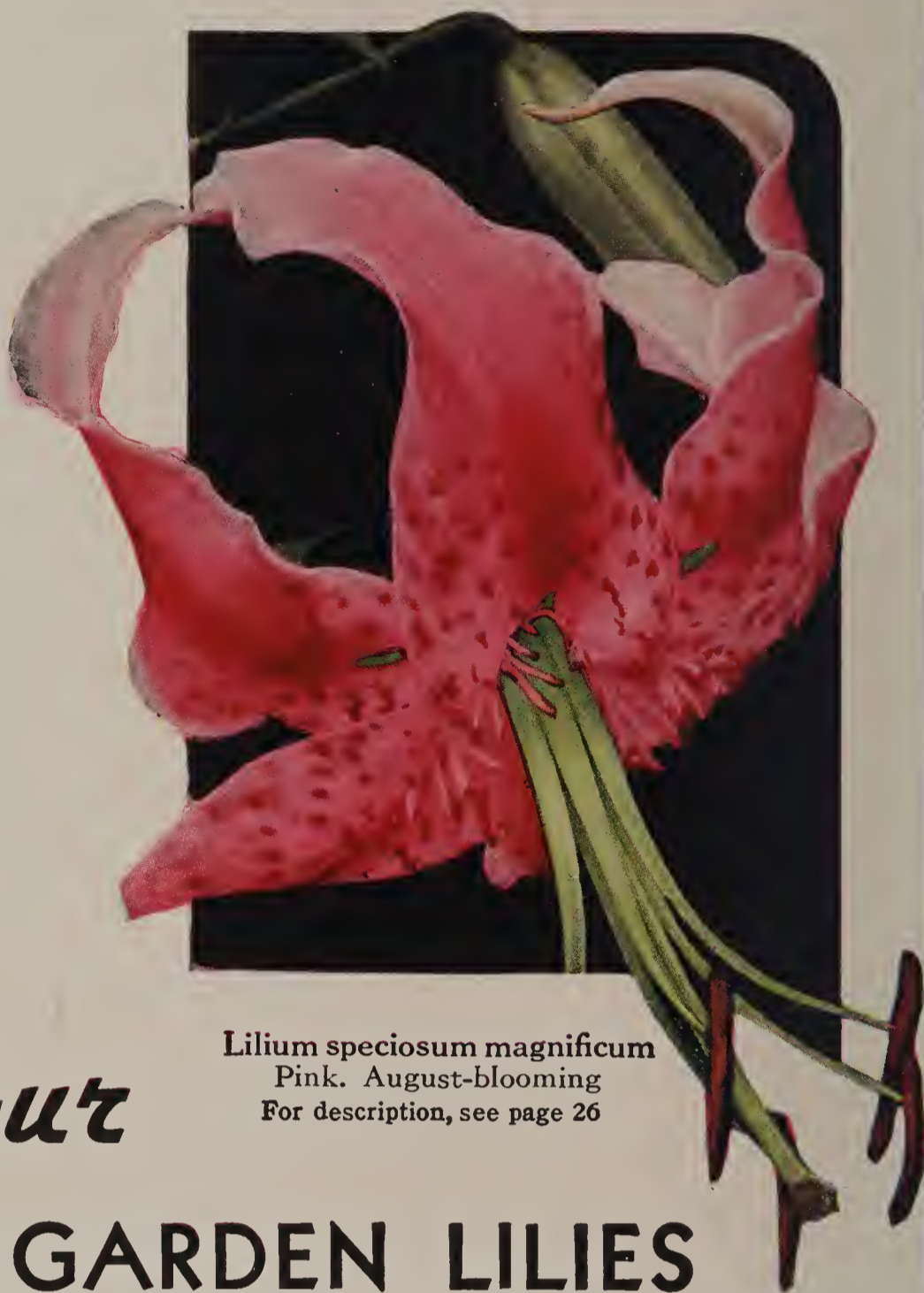
Lilium speciosum magnificentum Pink. August-blooming For description, see page 26